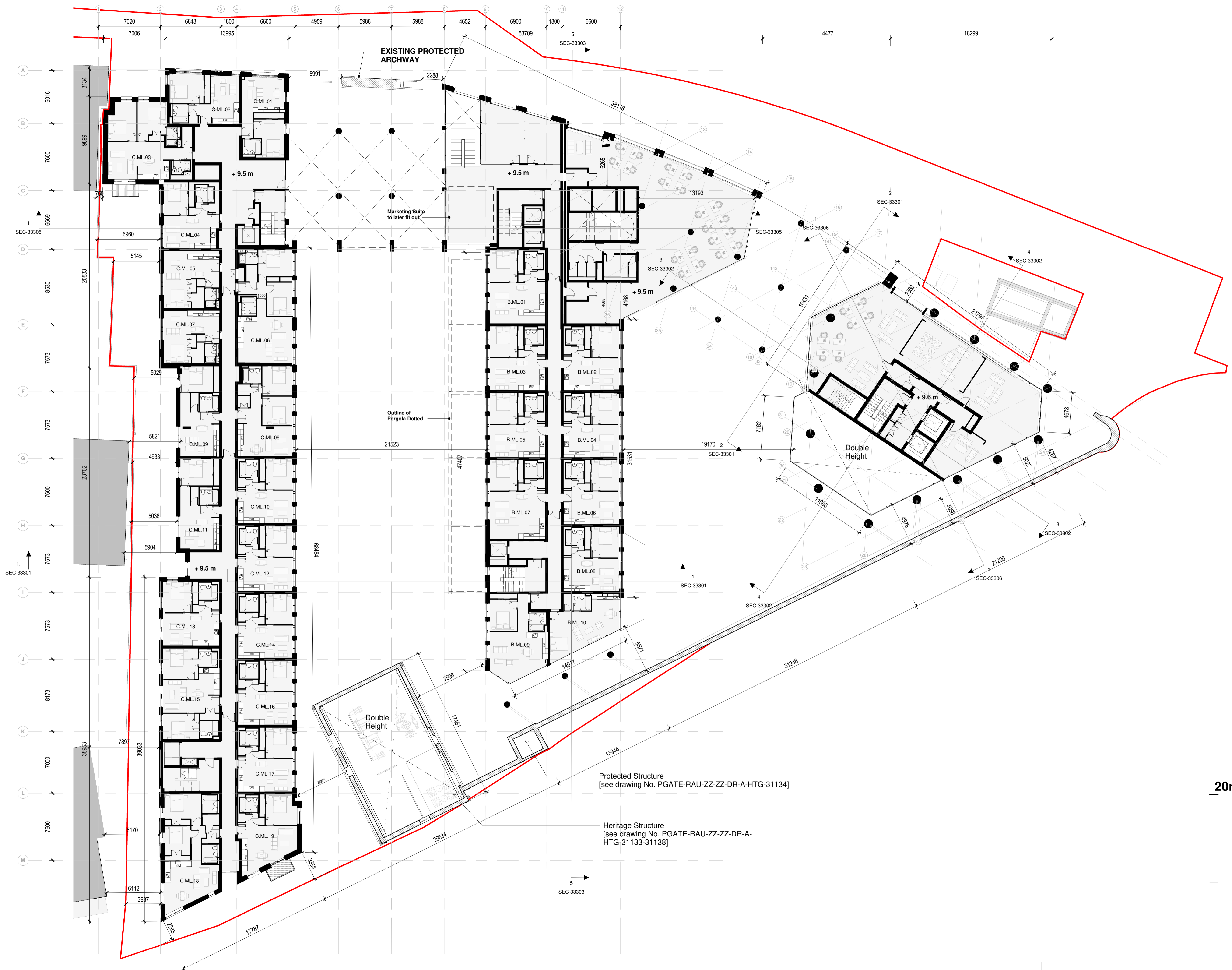
Proposed Mezzanine Floor Plan 1 : 200